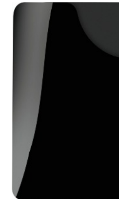
Walnut / Black